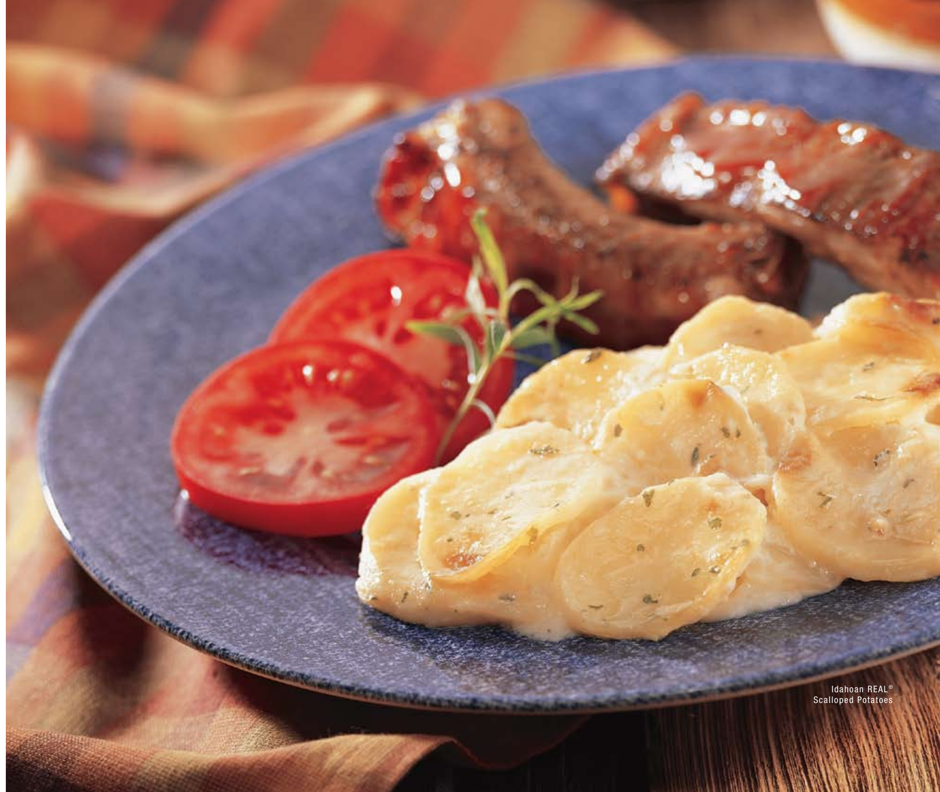
Idahoan REAL ® Scalloped Potatoes