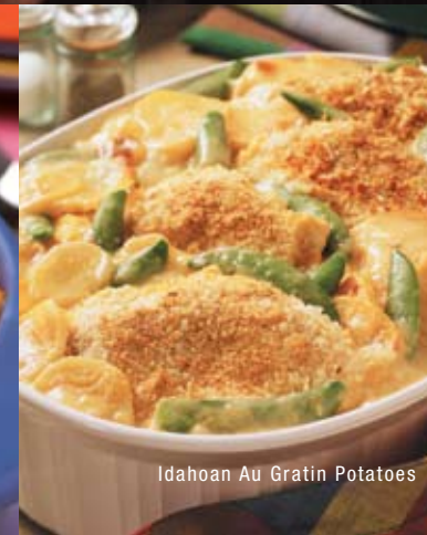
Idahoan Au Gratin Potatoes