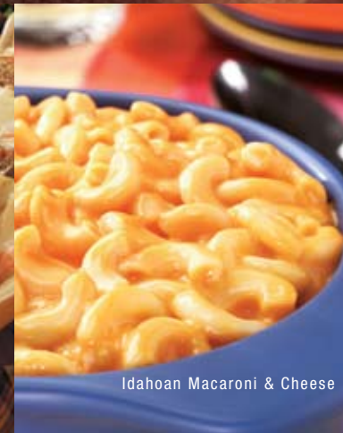
Idahoan Macaroni & Cheese