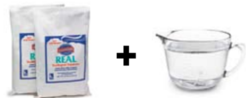
POTATO SLICES & SAUCE MIX